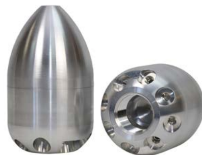
8 Jets at 15° and 25° or 25° and 40°

KEG's Cleaning Nozzle is also available in 3/8" and 1/2" configurations, giving the small jetter operator the advantage of fluid mechanics not ordinarily available in other smaller nozzles.