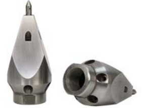
1" Rambo Nozzle