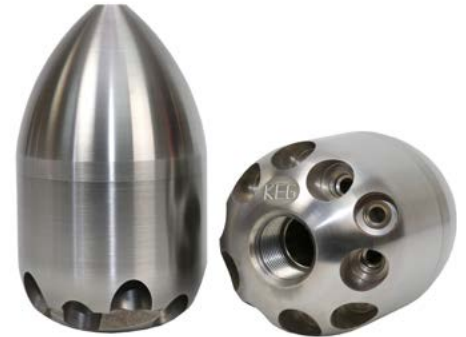
10 or 12 Jets at 15° and 20°

The 15° and 20° jet angles give the operator high wall force with a wide water pattern necessary to clean large diameter pipes of buildup and debris. The 10 or 12 insert set-up can be configured in steel or titanium ceramic. The Sewer Nozzle is a Tier Three Nozzle, and is over 80% efficient!